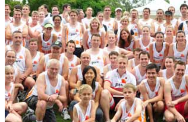
The foundation was a major beneficiary of the PricewaterhouseCoopers Cool Night Classic 2010.